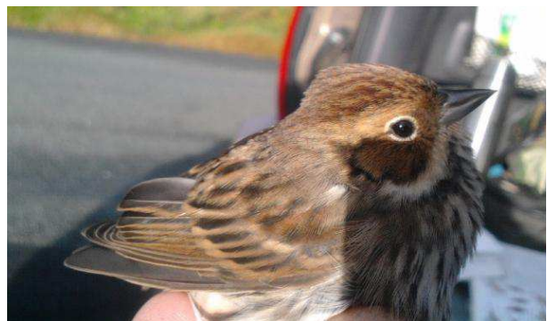
Little Bunting at Agden (S. Samworth)

Stonechat - Records from various locations, including threes at Ramsley Moor on 1st September, Broomhead Moor on 2nd and Ewden Beck on 2nd, and fours at Redmires on 23rd, Big Moor on 9th October, Agden on 13th, and Ewden Valley on 21st, with five at Ewden Beck on 13th the highest count of the period. Birds were sighted at Outo