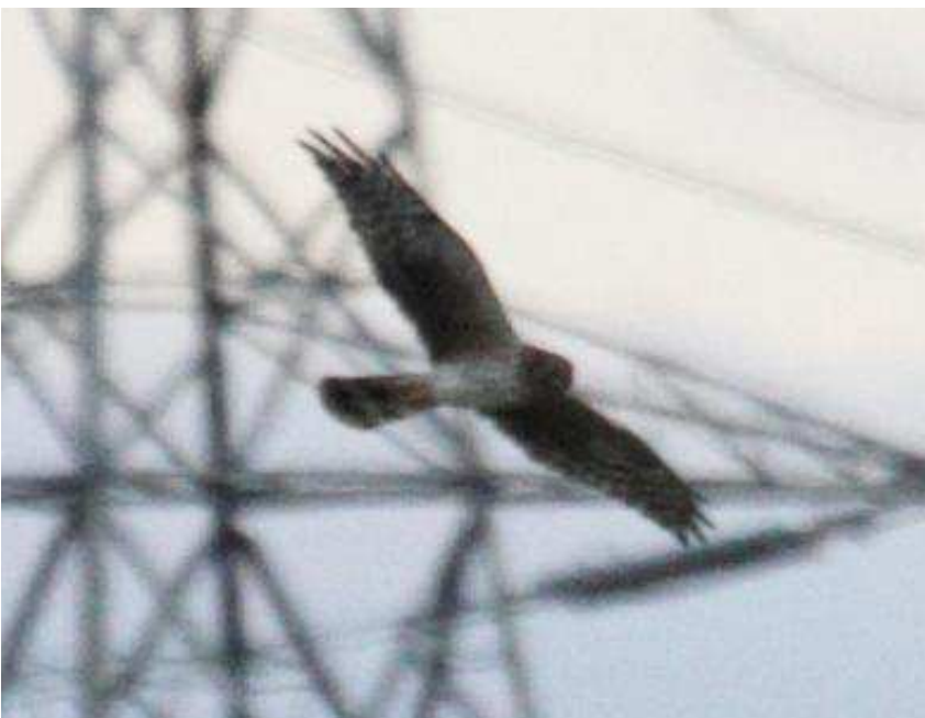
Pallid Harrier at Firsby Res (A. Deighton)