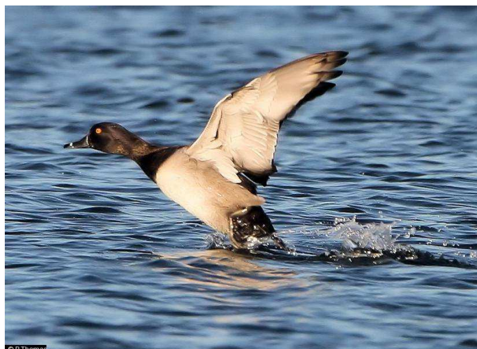
Ring-necked Duck at Orgreave Lakes (P. Thomas)

Ringed Plover - Singles at Orgreave Lakes and Redmires on several dates in