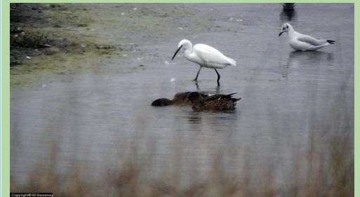
Little Egret – M Sweeney

Yellow-Legged Gulls were still being recorded in reasonable numbers in early Sept with five at Middleton Moor on the 5th, four at Langsett Res on the 11th and three at Wardlow on the 12th. Counts of Lesser Black-backed Gulls peaked at 1,390 on the 5th at Middleton Moor.