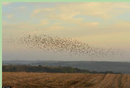
Linnet – C Kelly

Early Sept brought large hirundine flocks to Thrybergh CP with 250+ House Martins there on the 4th and 5th and at least 600 Swallow on the 8th. Other interesting records included a Cetti's Warbler at a site in Rotherham on the 6th and 27th, a Black Redstart at Stanage Edge on the 26th, six Twite at Mam Tor on the 20th and an unusually large flock of 1,200 Linnets feeding in a field at Onesmoor on the same date.