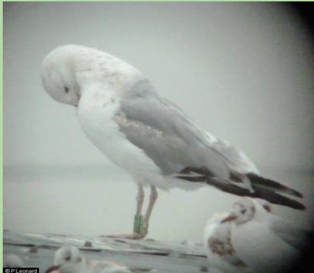
Caspian Gull – Paul Leonard

Early August highlights included a number of interesting Gull records when on the 2nd a colour-ringed Caspian Gull was at Parkgate and