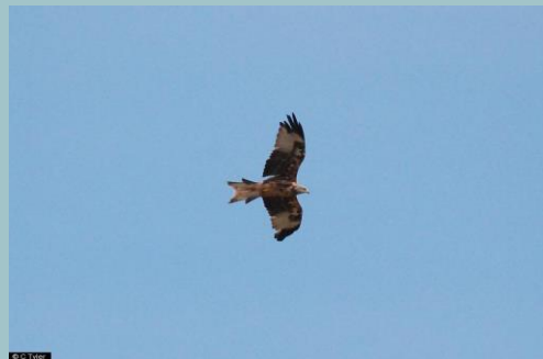
Red Kite – C Tyler

Interesting Raptor records included two sightings of Red Kite , one circling near Ravenfield Dumpsite on the