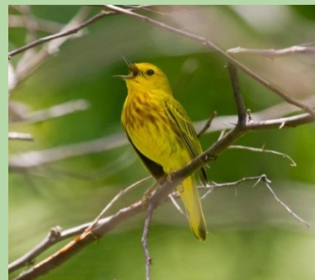
Antigua – Yellow Warbler (P Garrity)

At a previous indoor meeting it was suggested that the membership had a wealth of knowledge and expertise around birding trips abroad. Yet that is not widely shared except when a local member gives a talk on one of their trips