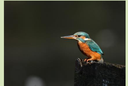
Kingfisher in Endcliffe Park

There's been a good response to the request for surveyors and all sites are now covered.