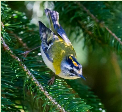
Firecrest