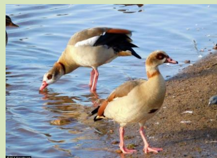
Egyptian Goose

Also on 28th sightings of a Red Kite at both Redmires and nearby Porter Clough within minutes of each other no doubt related to just the one bird, and the same day brought a fine adult Mediterranean Gull briefly to Catcliffe Flash and a spectacular party of 50 Whooper Swans to Middleton Moor, where 17 remained on the last day of what proved to be a better month than might have been expected.