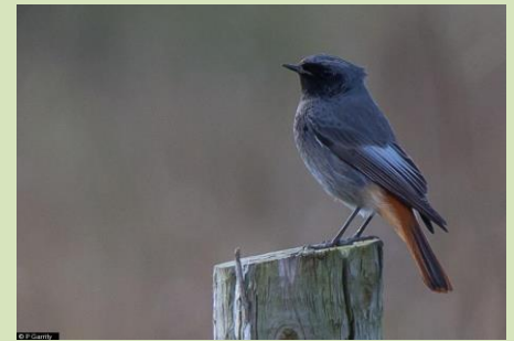
Black Redstart – P.Garrity

A Chiffchaff was a good find in a Malin Bridge garden on 10th and another was at Linacre Res on 11th, when a single Stonechat was at Topley Moss, and a Brambling visited garden feeders at Norton on 13th in a very poor showing for this species. Reports of a Black Redstart alongside the new housing estate at Waverley on 13th were confirmed the following day in the form of a fine male, which sometimes showed well but could also prove extremely elusive.