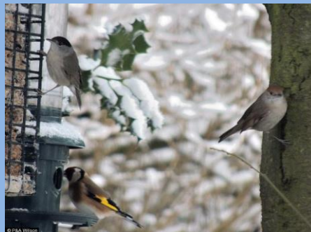
Blackcap – P&A. Wilson

On the following day a fine male Common Scoter was an unseasonal visitor to Thrybergh CP, a decent movement of Pink-footed Geese saw 500 NW at Middleton Moor and the owl-fest at Edge Mount included Barn , Short-eared and two Long-eared .