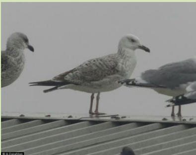
Caspian Gull – A. Deighton

January got off to a quiet start, the mild conditions leading to various records of resident species in song, including Song Thrushes at Roundwood Golf Course, Thrybergh Tip and Thrybergh CP on 1st, the latter site also holding two Water Rails to see in the New Year. A busy day's birding also brought an adult Caspian Gull on the rooftops at Attercliffe and a first-winter in the roost at Broomhead Res, as well as a Cetti's Warbler in song at Old Whittington SF. New Year's Day closed with both Barn Owl and Short-eared Owl at Edge Mount, excellent records for the uplands at this time of year, and further evidence of the mild conditions.