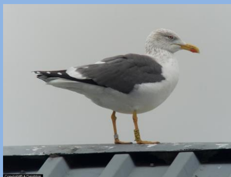
Lesser-black Backed Gull – A.Deighton

A dedicated larophile found some reward on the rooftops at Attercliffe on 12th in the shape of a German-ringed Lesser Black-backed Gull , and also on 12th a herd of 15 Whooper Swans visited Linacre Res, where two Shags remained to the end of the month, and another ten Whooper Swans headed N at Thrybergh CP on 13th. A pair of Stonechat at Orgrave Lakes on 15th was a good record in a poor couple of months for this species, and on the same day at least 15 Tree Sparrows visited feeders at Thrybergh CP, one of the few local strongholds for this declining species. An Oystercatcher was at Orgrave Lakes on 16th, when the male Black Redstart was seen again at Waverley Estate, seen on and off to the end of the month.