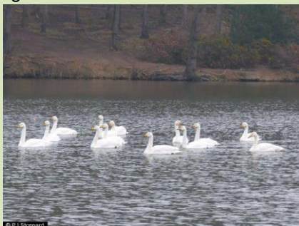
Whooper Swan – P.J. Stoppard

February began with a Mute Swan disrupting the traffic on Main Street, Rotherham before being manhandled back to the nearby Don Canal, and at Endcliffe Park a Little Grebe , two Kingfishers and two Dippers provided further urban birding delights. An early Curlew moved NW over Rawmarsh on 2nd and two Short-eared Owls hunting at Totley Moss made an early return to the uplands on 3rd. After a quiet few days, a single Dunlin visited Orgrave Lakes and a Red Kite drifted over Meadowhall on 9th, with what was presumably the same bird seen the following day over the M1 at Aston. Also on 10th a good showing of Short-eared Owls saw three at Leash Fen, two at Totley Moss and another two at White Lee Moor, with a Barn Owl at Kirk Edge for good measure. On 11th a Black Redstart made a re-appearance at the Waverley Estate and a Great Grey Shrike popped up on Big Moor, the same day seeing a good passage of Pink-footed Geese over the area, including 354 NW over Orgrave Lakes.