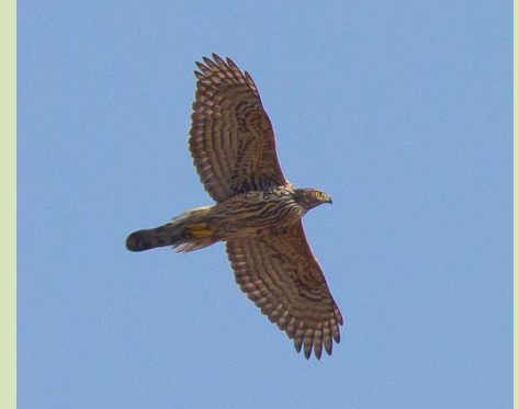
Goshawk

Our annual visit to Derwentdale to look for raptors. Previous highlights include Peregrine, Goshawk, Sparrowhawk, Merlin, Kestrel, Hen Harrier & Common Buzzard. Other species that we may see include, Common Crossbill, Siskin, Whooper Swan and Goosander to name a few; who knows we might also be "outraged" by Ravens!