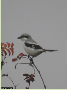
Great Grey Shrike (Leash Fen) – P Ridsdale

S/SW in one hour at Redmires Res and 200 Fieldfare S at the same location. Highlights elsewhere on the 1st included a Yellow-legged Gull at Langsett Res and a Great Grey Shrike at Ewden beck near the Shooting Lodge. Pink-footed Geese were also seen on the 2nd with 350 S at Abbeydale and 1,500+ in seven skeins E over Low Moor.