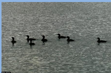
Shag

At least eight Shag were reported from Linacre Res on the 21st and eight were confirmed there on the 22nd.