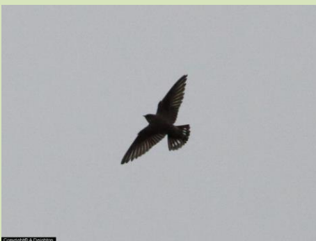
Crag Martin