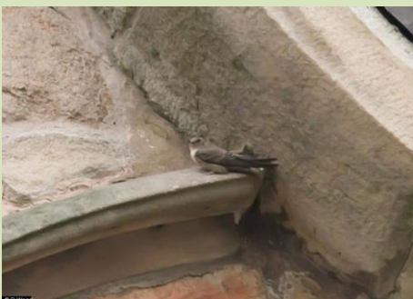
Crag Martin - David Wood

Woodpigeon were still moving on the 12th with 1,600 SW over Fulwood and a Firecrest was caught and ringed at Renishaw Park on the same day.