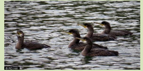
Shag

had reduced to six at Linacre Res on the 29th and five Jack Snipe were at Markham on the same date. Also reported on the 29th were 300 Fieldfare at Silverwood Lagoon and 36,000 Starling at Middleton Moor.