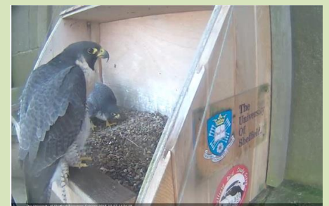
Sheffield University webcam

A pair of Peregrines returned to St George's nest platform on the 7th with the male showing signs of courtship display.