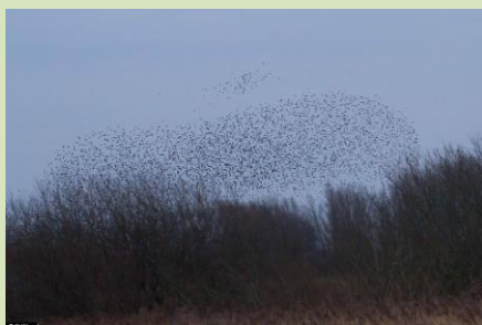
Starling – Middleton Moor – Dave Wood

Single Caspian Gulls were reported from Attercliffe again on the 14th and 15th whilst two Black-tailed Godwits reported from Orgreave Lakes on the 16th were still present on the 17th. Lapwing numbers were building with 170+ at Thrybergh CP on the 18th and 184 at Freeburch on the 21st. Three Caspian Gulls at Rectory Road, Duckmanton on the 22nd included one adult and two 2cy. On the 24th 400 Golden Plover and 150 Fieldfare were at Peat Pits whilst 1,700 Black-headed Gulls were reported from Broomhead Res. There were still geese moving on the 25th with 146 Pink-footed Geese SE over Attercliffe, the single female Scaup was still present at Rother Valley CP on the 26th and gull numbers at roost were impressive on the same day when Broomhead Res produced 2,000 Black-headed Gulls and 248 Herring Gulls . A single Jack Snipe was seen at Silverwood Lagoon on the 27th and in the morning of the 28th a number of reports of Pink-footed Geese skeins included 230 in two skeins W over Thrybergh CP, 325 in two skeins W over Stocksbridge and 160 in two skeins NW over Linacre Res. On the same day the Starling roost at Middleton Moor had reached 45,000 in number.