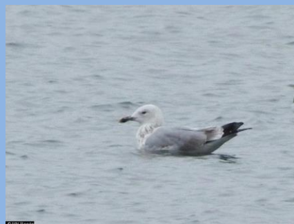
Caspian Gull – M Reeder

The 17th also proved to be another good day for passage geese as records of circa 2,800 Pink-footed Geese were reported from across the area. The most significant counts included 520 in three skeins at Redmires, and at least 700 in five skeins at Bowden Housteads Wood. A further 400+ flew E in three skeins over Eyam on the 18th. Elsewhere on the 18th a single Mediterranean Gull flew N over Haugh Rd, Rawmarsh and a 2nd winter Caspian Gull was reported from Orgrave Lakes.