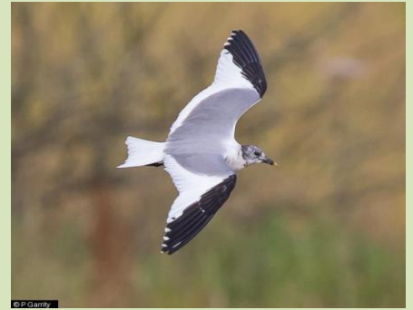
Sabines Gull (Carr Vale NR- P.Garrity)