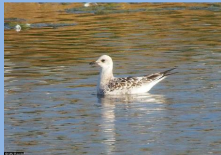
Mediterranean Gull (Orgreave lakes)

single there on 5th and 17th August, a single Mediterranean Gull at Orgreave Lakes on 1st August and a count of 900 Black-headed Gulls at Orgreave Lakes on the 9th August.