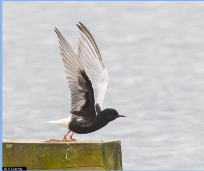
White-winged Black Tern (Orgreave)

A stunning summer-plumaged adult White-winged Black Tern that paid brief visits to Swillington, Fairburn and Old Moor settled at Orgreave Lakes from mid-afternoon on 7th July. It flew north that evening and returned the following morning before moving to nearby RVCP, then returning late afternoon. Appearing high from the north at 06:30 on the 9th it spent 30 minutes preening itself before heading to RVCP where it remained until the 12th.