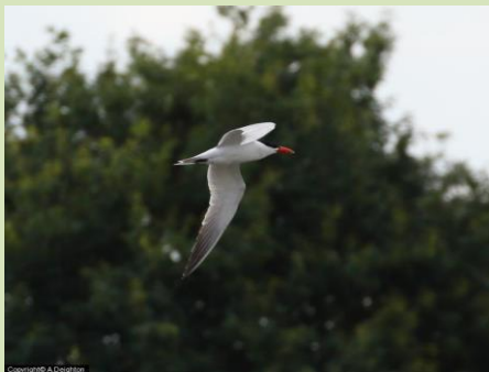
© A.Deighton Caspian Tern (Carr Vale NR - A.Deighton)

Other highlights in the month included up to 3 Red Kite in the Bradfield Rocher area from the 23rd July - 7th August, a roost of 600 Black-headed Gull reported at Sheffield Airport on 25th July and a max of ten Yellow-legged Gulls at the same location on the same day with daytime birds frequently seen in the Attercliffe area notably four there 27th July. Elsewhere a cream-crowned Marsh Harrier was in the Broomhead Moor area from the 26th July with sightings presumably of the same bird until the end of Aug. Other singles were reported from Stocksbridge 28th July, Rivelin Brook on 16th Aug and a very impressive record of four at Emlin Ridge on 28th Aug. Little Egrets were well represented with 37 individuals recorded during the period. Notable records were six at Orgreave Lakes on the 29th July and five there on 18th Aug. Finally a fem/immature Common Scoter was at Thrybergh CP from 30th July - 4th Aug.