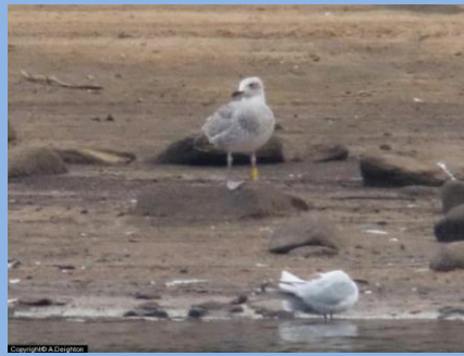
Caspian Gull (Langsett Res)

Interesting Gull reports featured in the early part of the month with an adult and a colour-ringed juvenile Caspian Gulls roosting at Langsett Res on the 31st July and 12th Aug with a