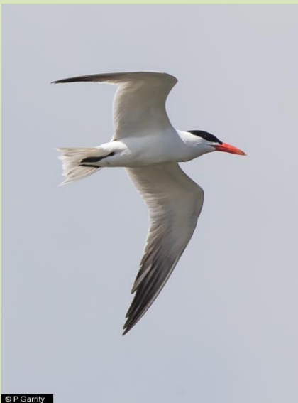
© P.Garrity Caspian Tern (Carr Vale NR – P.Garrity)