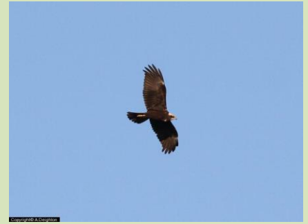
Marsh Harrier (Emlin Moor)

finally a single juvenile Spotted Redshank was reported on the 19th and 26th Aug.