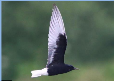
White-winged Black Tern (RVCP – P.Thomas)

Aside all the excitement, waders continued to feature with single Green Sandpipers recorded in July at Orgreave on the 8th, RVCP on the 11th and Silverwood Lagoon on the 19th whilst an Avocet was at Orgreave on 11th July and an adult Sanderling there on the 13th. July continued to astound when a 1st summer Sabines Gull was present at Carr Vale NR from the 13th - 20th but was, for most observers, just outside our area. A handful of individuals were however lucky enough to witness it enter SBSG airspace on a couple of occasions.