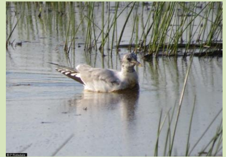
Sabines Gull (Carr Vale NR)

The second half of July provided good numbers of hirundines with a maximum count of 511 Swift over Rawmarsh on the 17th, 350 House Martin at Orgreave on the 22nd, 200 Swallow at Middleton Moor on the 24th and 157 Swallow were at Redmires on the same day. Elsewhere two Garganey (possibly a pair) were at Catcliffe Flash between 20th - 30th and a single juvenile Mediterranean Gull was at Orgreave Lakes on the 23rd.