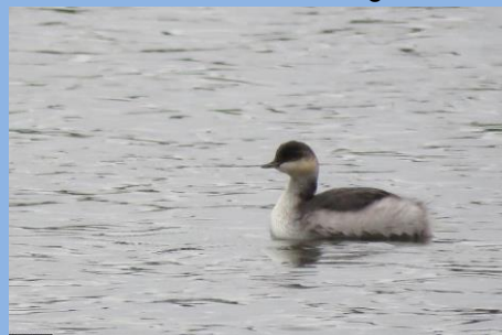
© P.Brown Black-necked Grebe (Thrybergh CP – P.Brown)

Other interesting records included a single Black-necked Grebe at Thrybergh CP on the 2nd Aug, single Turnstone at Orgreave Lakes on 10th and 19th Aug, a Whimbrel over Rawmarsh on 11th Aug and single Red Kite reports from Orgreave and Rawmarsh on the 11th Aug, Eyam Edge and Westend Moor on the 12th Aug and at Blue Man's Bower and Miller's Dale on the 21st Aug.