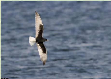
White-winged Black Tern (Orgreave – D.Wood)

A good start for July included records of waders with a single Whimbrel over Rawmarsh on the 3rd and one over Orgreave on the 11th. Black-tailed Godwit were also present at Orgreave Lakes with one on the 9th, five on the 11th and four on the 24th.