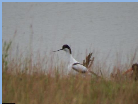
Avocet (Orgreave)

Aside all the excitement, waders continued to feature with single Green Sandpipers recorded in July at Orgreave on the 8th, RVCP on the 11th and Silverwood Lagoon on the 19th whilst an Avocet was at Orgreave on 11th July and an adult Sanderling there on the 13th. July continued to astound when a 1st summer Sabines Gull was present at Carr Vale NR from the 13th - 20th but was, for most observers, just outside our area. A handful of individuals were however lucky enough to witness it enter SBSG airspace on a couple of occasions.