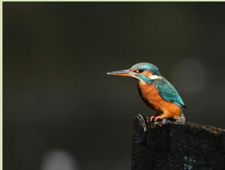
Kingfisher in Endcliffe Park (David Wood)

Please submit your records as soon as possible via the website and don't forget to include breeding information.