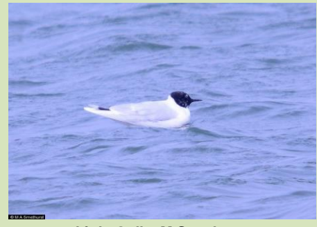
Little Gull

The Rotherham Cetti's Warbler was still singing on the 10th and during the day the first report of the year of a male Pied Flycatcher came from Chatsworth Park. The 11th turned into a remarkable day with an influx of Little Gulls across the region a phenomenon echoed in other areas of the UK. In the morning (7.50-12.05) 14 were at ThryberghCP along with a single Mediterranean Gull. These were followed by 12 at Orgreave Lakes (from midday) which may have been part of the same group, two birds at Silverwood Lagoon in the mid-afternoon and a single bird at Underbank Res.