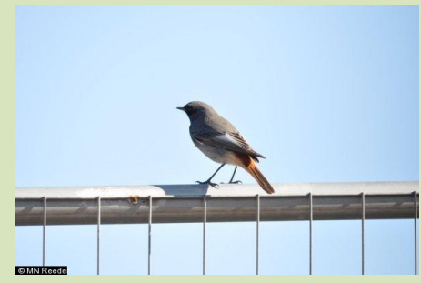
Black Redstart - M. Reeder

off NW over Nether Haugh and on the same day Whooper Swans were also moving across the area with seven NW over Rawmarsh and 25 leaving N from Thrybergh CP.