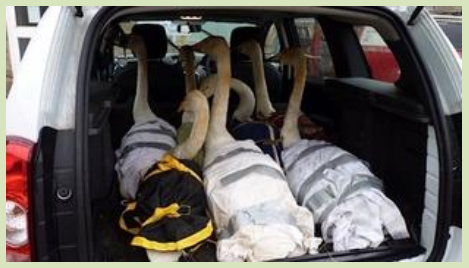
Whooper Swans