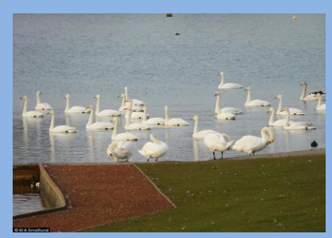
Whooper Swan

Lakes and reservoirs were productive during this period when the longstaying Shags at Linacre Res were down to two in number on the 9th, a Kittiwake was reported from Langsett Res on the 10th and another was at Orgreave Lakes on the 11th when an excellent count of 13 Common Scoter were also present on the same day. An apparent purple patch for Whooper Swan records commenced on the 11th when 15 were reported at Middleton Moor, 11 were at Orgreave Lakes, 19 were at RVCP and at least singles were reported over Aston Silverwood. On the 12th a max of 44 were at Agden Res and 17 were confirmed at Middleton Moor. Also at Middleton Moor on the same day were 2 Pintail and a single Red Kite flew over fields to the W of the lagoons. An early singing Chiffchaff was reported from Thrybergh CP on the 13th whilst elsewhere there were 400 Wigeon feeding on grassland at Denaby Common and 300 Golden Plover at Peat Pits. Further Whooper Swan highlights included 40 over Carr Vale NR on the 14th, 46 at Thrybergh CP on the 15th, 11 at Broomhead Res on the 16th and 16 at Middleton Moor on the same date.