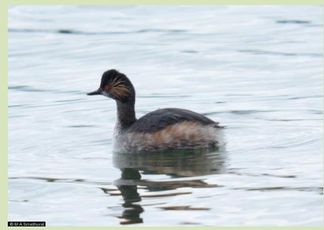
Black-necked Grebe - M. Smethurst

received from Grenoside. Interesting reports on the 5th included two Jack Snipe at Blackburn Meadow NR, 16 Whooper Swan at Middleton Moor and the appearance of a Blacknecked Grebe at Thrybergh CP.