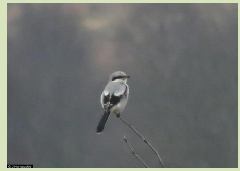
Great Grey Shrike - J. Hornbuckle

confirmed as an area record during that time, whilst conversely the Great Grey Shrike proved to be a stayer with reports through to the end of March.