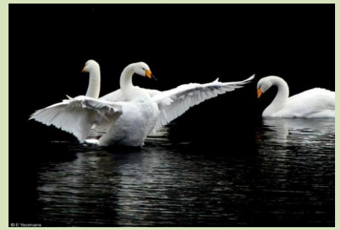
Whooper Swan - E. Yeomans

An unremarkable start to March had few highlights however these included good numbers of Jack Snipe which remained at Woodhouse Washlands with 11 recorded on the 1st, 17 Whooper Swans were reported from Middleton Moor on the same day and 17 were at Howden Res on the 3rd.