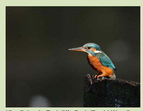
Kingfisher in Endcliffe Park

With spring finally here and the breeding season under way, please get out there to record the birds in Sheffield's parks and submit your records via the website.