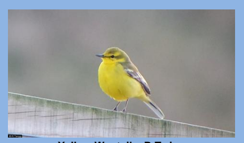
Yellow Wagtail

A good start to the month with another Osprey sighting at Baslow on the 1st, the first Yellow Wagtail of the year at Orgreave Lakes on the 2nd and a Marsh Harrier at Middleton Moor on the 3rd.