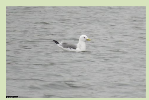
Kittiwake

A single Common Scoter was reported at Rivelin Res on the 21st and nearby on the same day a Red Kite was at Fox Hagg. Following this the frequency of Red Kite records intensified as a further 8 reports were received up to the end of the month. An adult Kittiwake at Thrybergh CP on the 23rd was followed by another adult (possibly the same bird) at Orgreave Lakes on the 24th whilst elsewhere the first reported Ring Ouzel of the year was in the Burbage Valley on the same Day.