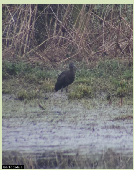
Glossy Ibis

The Waverley Black Redstart appeared again on the 19th and then made a final appearance it seems on the 20th when on the same day late in the afternoon came the news of a Glossy Ibis at Carr Vale NR, although it was thought to be outside of the recording area at the time.